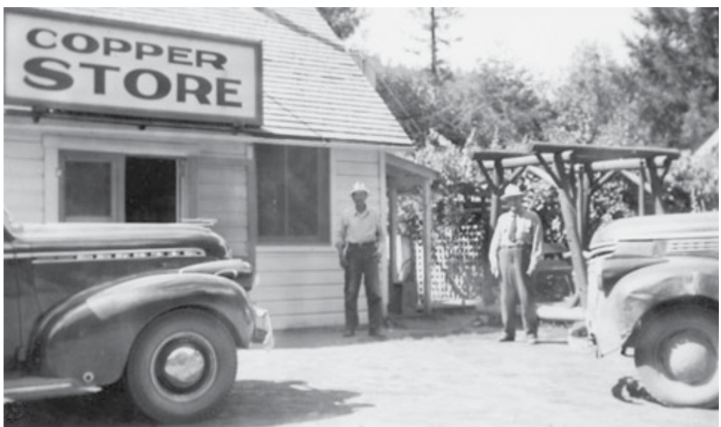
Photo below: The Copper Store before the construction of the Applegate Dam.

Photo above: Applegate Lake.