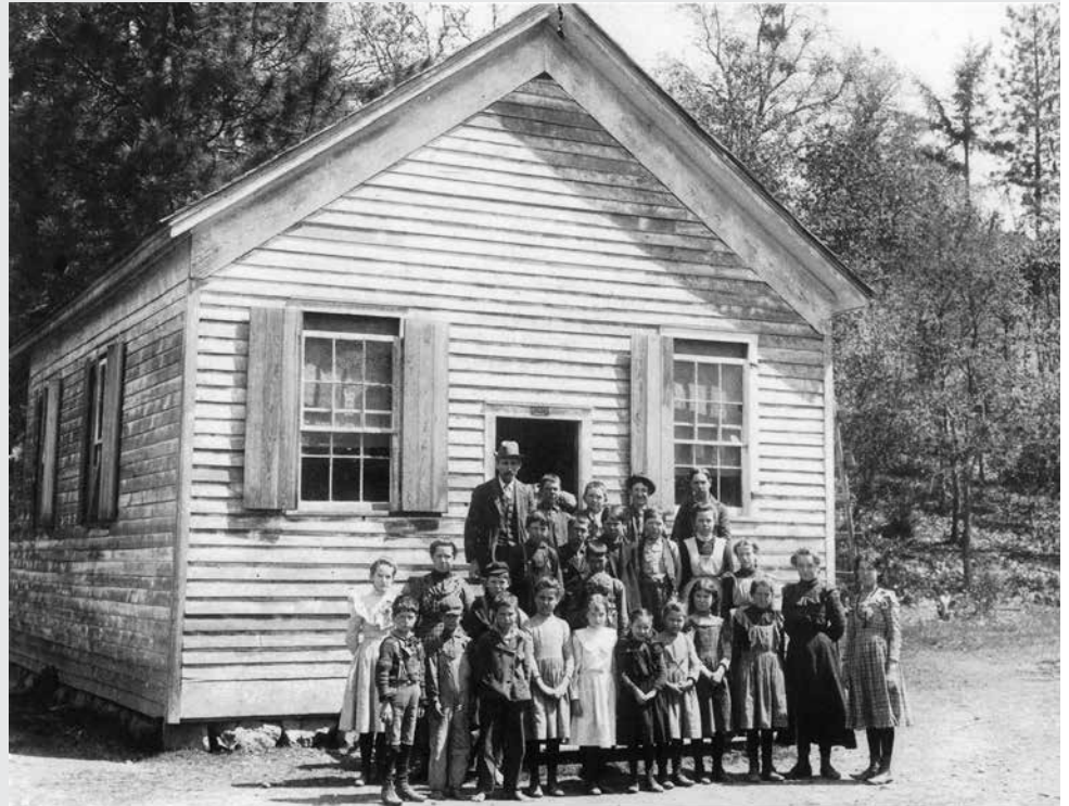
Applegate School, 1902 SOHS Photo #15376